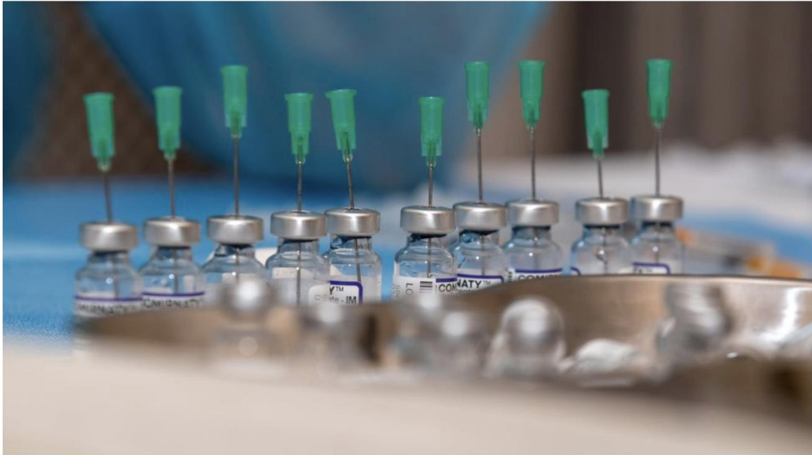
Mehrere kleine Flaschen Cominarty stehen zur Impfung bereit. Doch was ist eigentlich drin?

German article, 28 September 2023: What happens when DNA enters the cell nucleus?